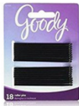
Roller Pins (3 inches)

Some cute costumes call for complementary hair accessories, but these are especially prone to falling out while the performers are twirling and leaping. If you're wearing a headpiece, decorative flower, bow, extensions or fake ponytail, there are a few tricks you can use to ensure the piece stays in place. The most well-known trick is to simply put roller pins. Roller pins are wonderful for holding hair accessories and hair in place. While you can use smaller bobby pins you will need a lot to hold the headpiece in better to go with the roller especially if your child's hair is long or thick. Try to place the pins so they're crossing each other, as this will create a better hold.